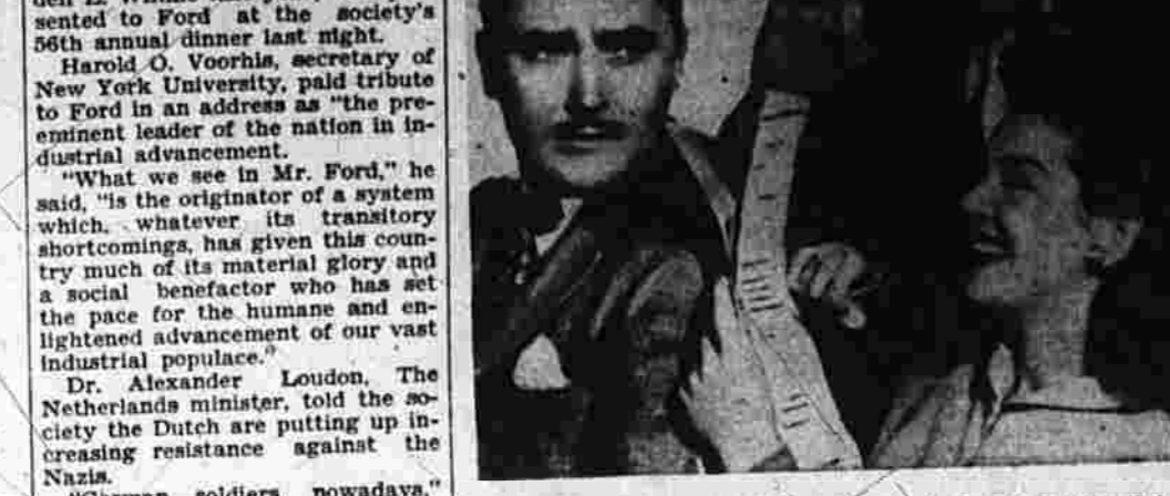
Brian Aherne, Robert Benchley and Rosalind Russell in Under-27's exciting romantic comedy, "Hired Wife" at the State theater here Sunday and Monday.

3 1/2 miles of reinforced concrete pavement on Hartford road.